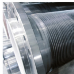
Various types and sizes of cooling/heating cylinder 各种类型和尺寸的冷热料筒