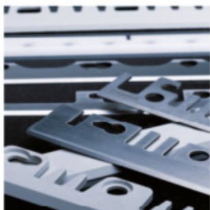
Scrapper knives in various forms and material 各种形状和材料的刮刀

To secure the minimum downtime for maintenance and repair on site we give this service the highest priority and we supply all spare parts within shortest delivery time. 为确保现场维护和维修的停机时间最少，我们将维护和维修置于最高优先级，并在最短的交货时间内提供所有零部件。